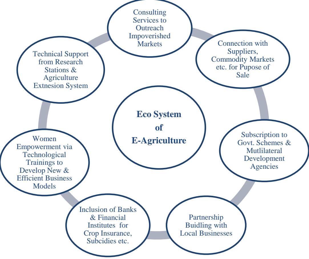
Fig-1 Eco-system of E-agriculture

Use of E-Agriculture technology strengthen the conventional agricultural system and enhance the productivity in the agriculture value chain for everyone. Also, initiatives of E-Agriculture bring together a broad scope of indigenous and regional stakeholders to form a mutually beneficial value chain including addition of value to an article, production, promotion/marketing, and the providing after-sales service [5]. The role of E-Agriculture Value Chains is multidimensional and influencing the quality performance in various ways. The use of ICT in various agricultural activities at different stages is increasing in every components of the agricultural value chain with dissemination of information to farmers, particularly smart phones. The value chain concept of E-Agriculture Ecosystem has been stretched beyond identity of individual firms by connecting various distribution networks and adding up the following supporting factors in the growth of farmers: